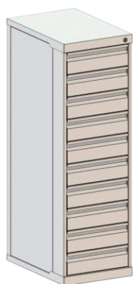
430mm WIDE CABINET